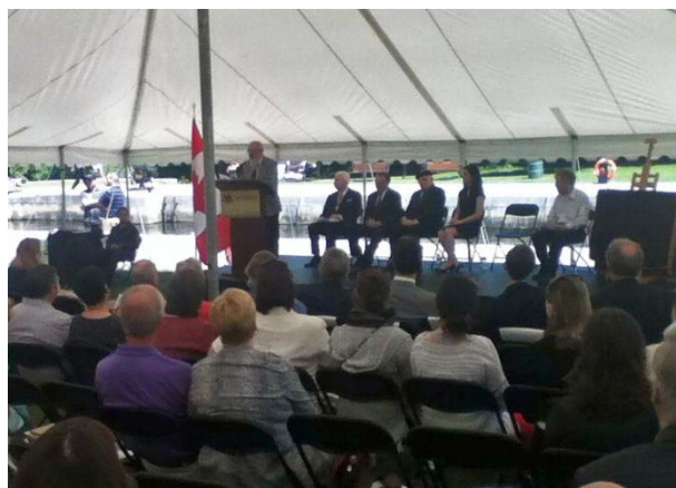
Unveiling ceremony, June, Rideau Locks, Ottawa