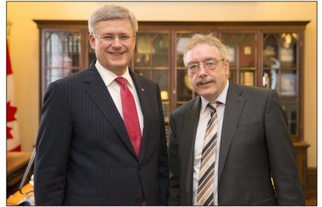
Office of the Prime Minister Canada

Left: Canadian Prime Minister Stephen Harper with Tánaiste and Minister for Foreign Affairs and Trade, Eamon Gilmore in Ireland. Right: Prime Minister Harper with Ambassador Bassett in Ottawa prior to the visit.