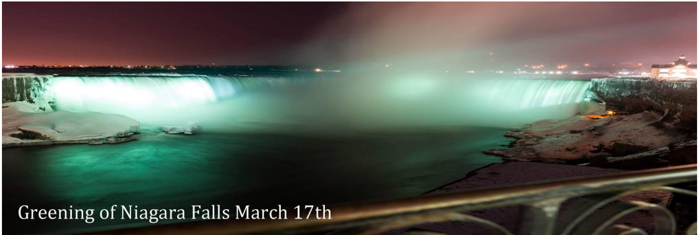
Greening of Niagara Falls March 17th