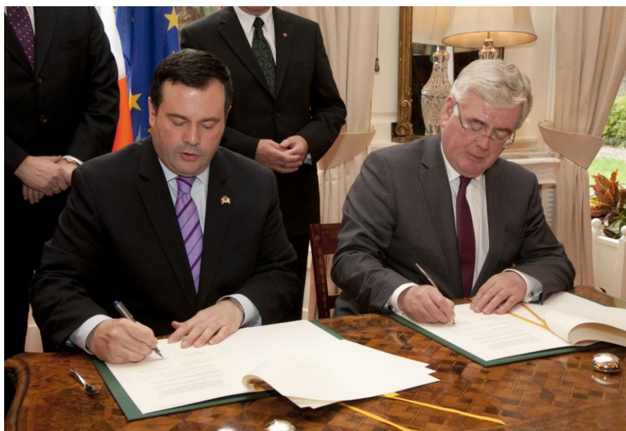
Dublin- Minister for Citizenship and Immigration Jason Kenney (left) and Tánaiste Eamon Gilmore sign the amendments to the Memorandum of Understanding between Canada and Ireland regarding the Working Holiday Programme.

In October, the Tánaiste and Minister for Foreign Affairs and Trade, Eamon Gilmore, T.D., and the Hon. Jason Kenney, M.P., Canada's Minister for Citizenship and Immigration announced substantial enhancements to the Ireland Canada Working Holiday Programme. The announcement will see the number of visas available for Canadian and Irish participants double to over 10,000 by 2014 and see the length of stay extended from one year to two years.