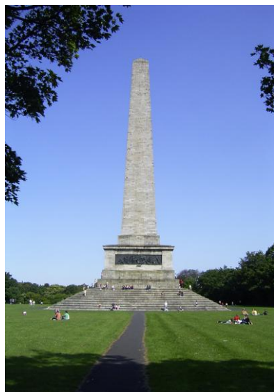
The Wellington Monument

This austere old Fort was constructed in 1734. The Lord Lieutenant of Ireland, Lionel Sackville, 1st Duke of Dorset directed that a powder magazine be provided for Dublin. This led local scribe Jonathan Swift to write "Now's here's a proof of Irish sense, Here Irish wit is seen, When nothing's left that's worth defence, We build a Magazine"