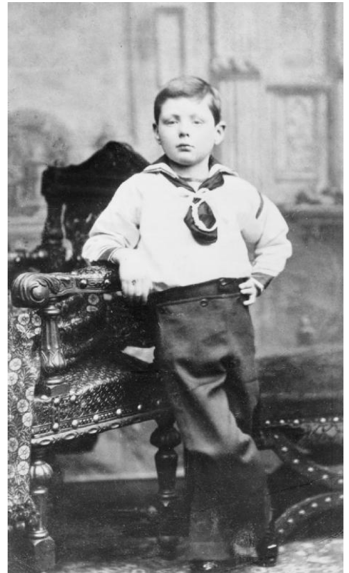
Winston Churchill 1881-boyhood days in Ireland

The Phoenix Park is completely enclosed by stone walls and has been for hundreds of years. These walls wind their way around its periphery for 11 km. The 1,760 acres offers a variety of landscapes and places which resonate with historical connections.